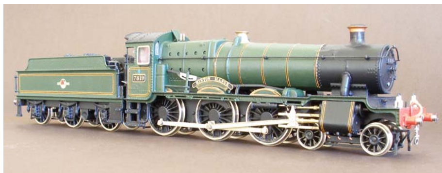
7819 HINTON MANOR